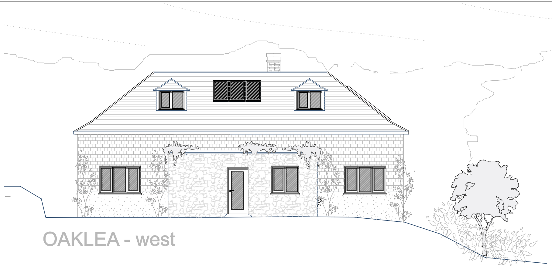
OAKLEA - west