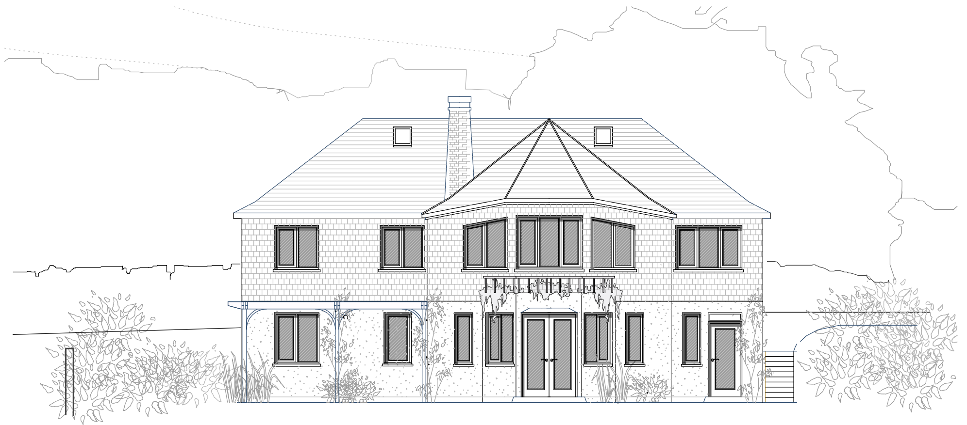
OAKLEA - east